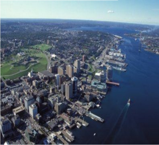
Historic Citadel Hill, in the centre of downtown Halifax and the amazing Halifax Harbour